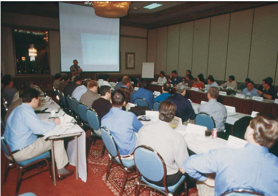
More than 700 of the most successful building contractors comprise the Jack Miller Network.