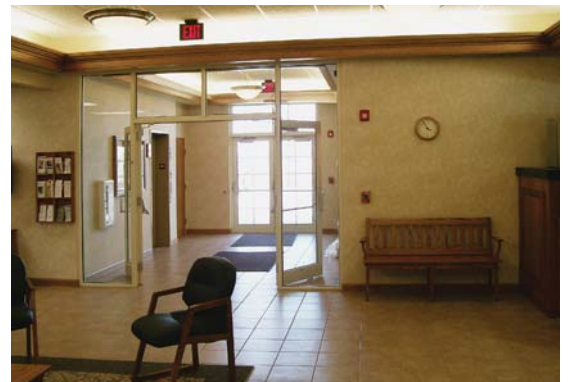
Pictured above are the exterior and interior views of Midwest Bank of Western Illinois, Galesburg, Illinois.